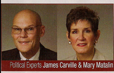
Political Experts James Carville & Mary Matalin