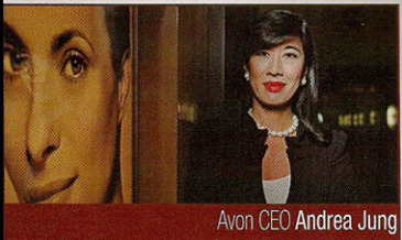
Avon CEO Andrea Jung